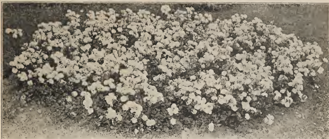
Polyantha Clothilde Soupert